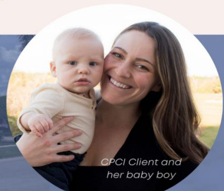
CPCI Client and her baby boy